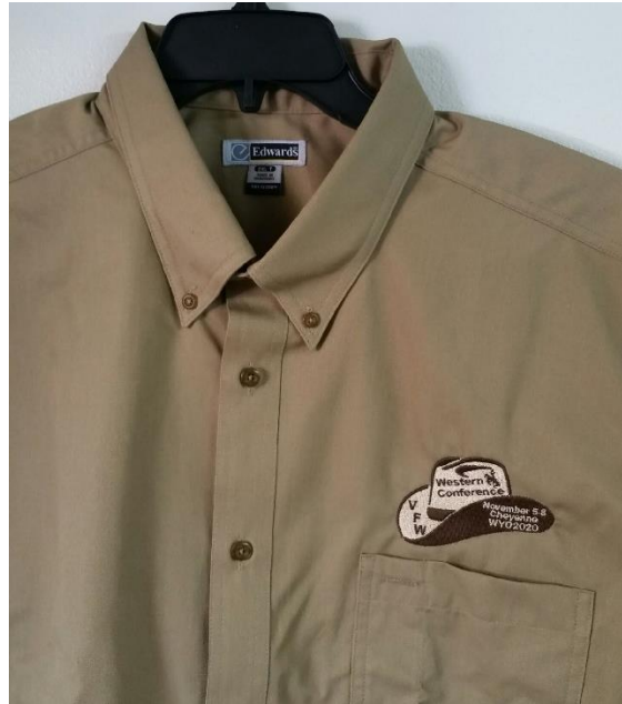
Button Down Short-Sleeved Shirt S – 2XL - $35 3XL – 6XL - $40