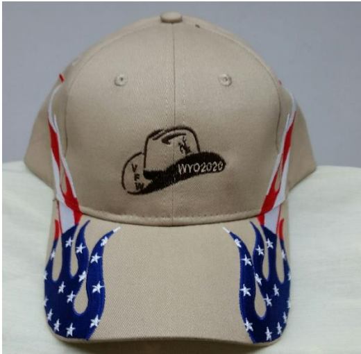
Cap with WYO 2020 Logo - $20